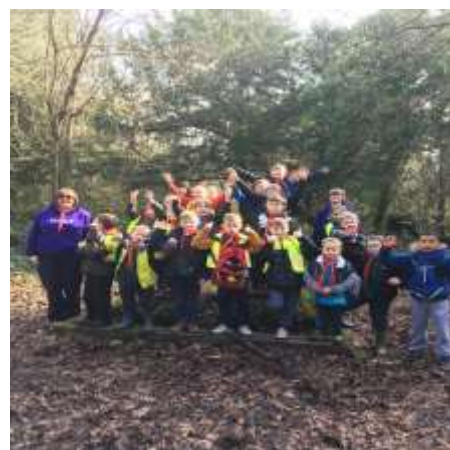
Local cubs and beavers collecting their 'outdoor' badge

Earlier this month a group of Cowplain cubs and beavers were having a 24 hour outdoor sleepover in order for them to get their outdoor badge. This included outdoor time in Park Wood, they were all very excited and thoroughly enjoying themselves learning and having fun at the same time. Surely one of the best ways to teach young people about nature and the local community. It is wonderful to see the wood being used in such a positive and constructive way.