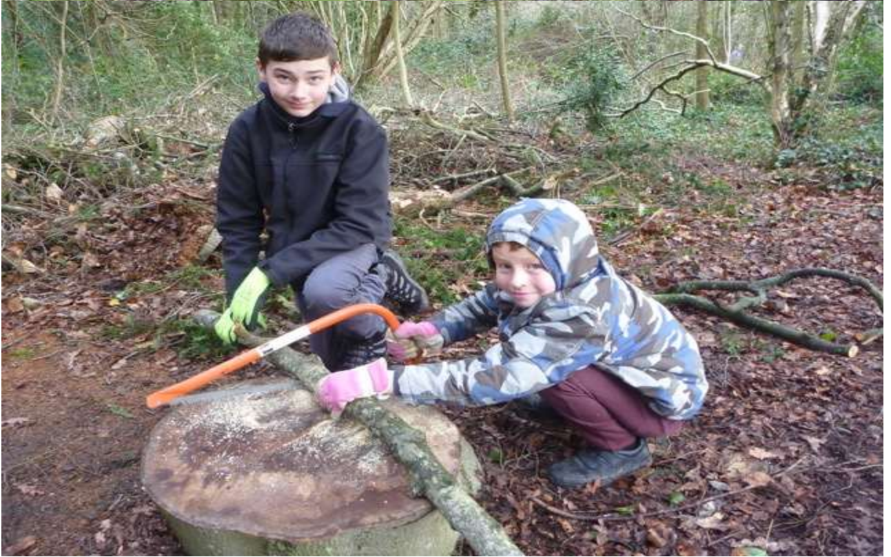
Ist Hart Plain Scout Group enjoying a work day at the end of February