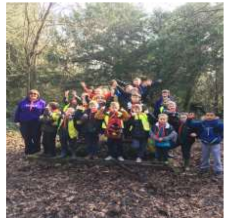
Local cubs and beavers collecting their 'outdoor' badge

Earlier this month a group of Cowplain cubs and beavers were having a 24 hour outdoor sleepover in order for them to get their outdoor badge. This included outdoor time in Park Wood, they were all very excited and thoroughly enjoying themselves learning and having fun at the same time. Surely one of the best ways to teach young people about nature and the local community. It is wonderful to see the wood being used in such a positive and constructive way.