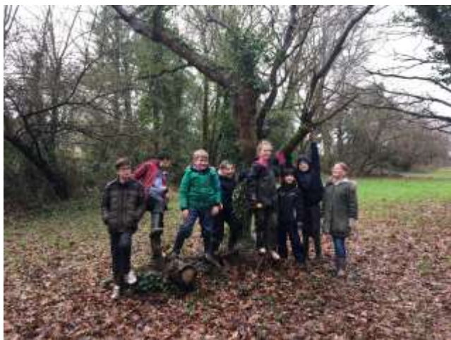
Local cubs and beavers At the January Workday

We were joined at the end of January by a local group of cubs and beavers and at the end of February by a group of local scouts. It was a pleasure having them help us on our end of month workdays and we look forward to working with them later in the year.