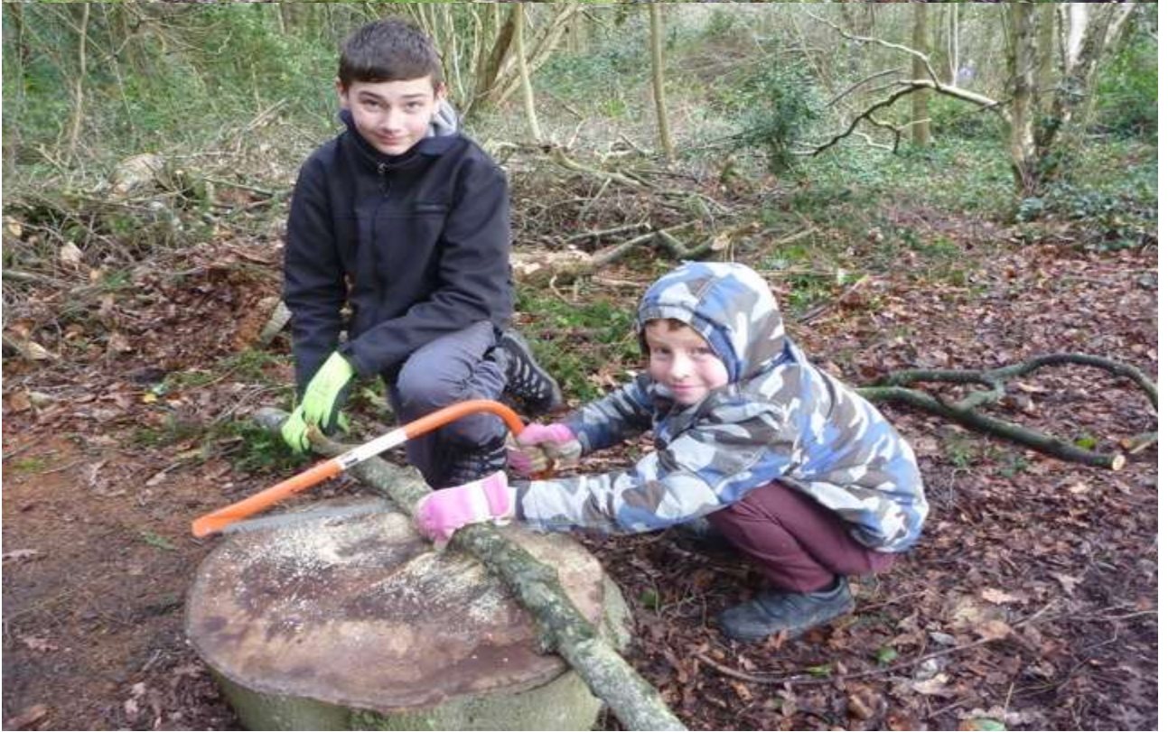
Ist Hart Plain Scout Group enjoying a work day at the end of February