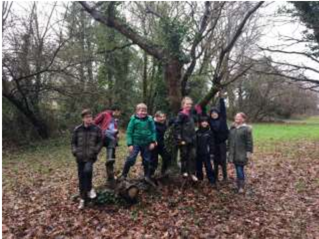
Local cubs and beavers At the January Workday

We were joined at the end of January by a local group of cubs and beavers and at the end of February by a group of local scouts. It was a pleasure having them help us on our end of month workdays and we look forward to working with them later in the year.